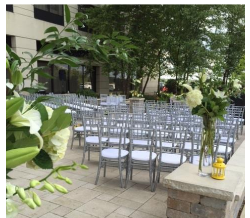
Naper Patio Ceremony