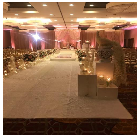
Grand Ballroom Ceremony